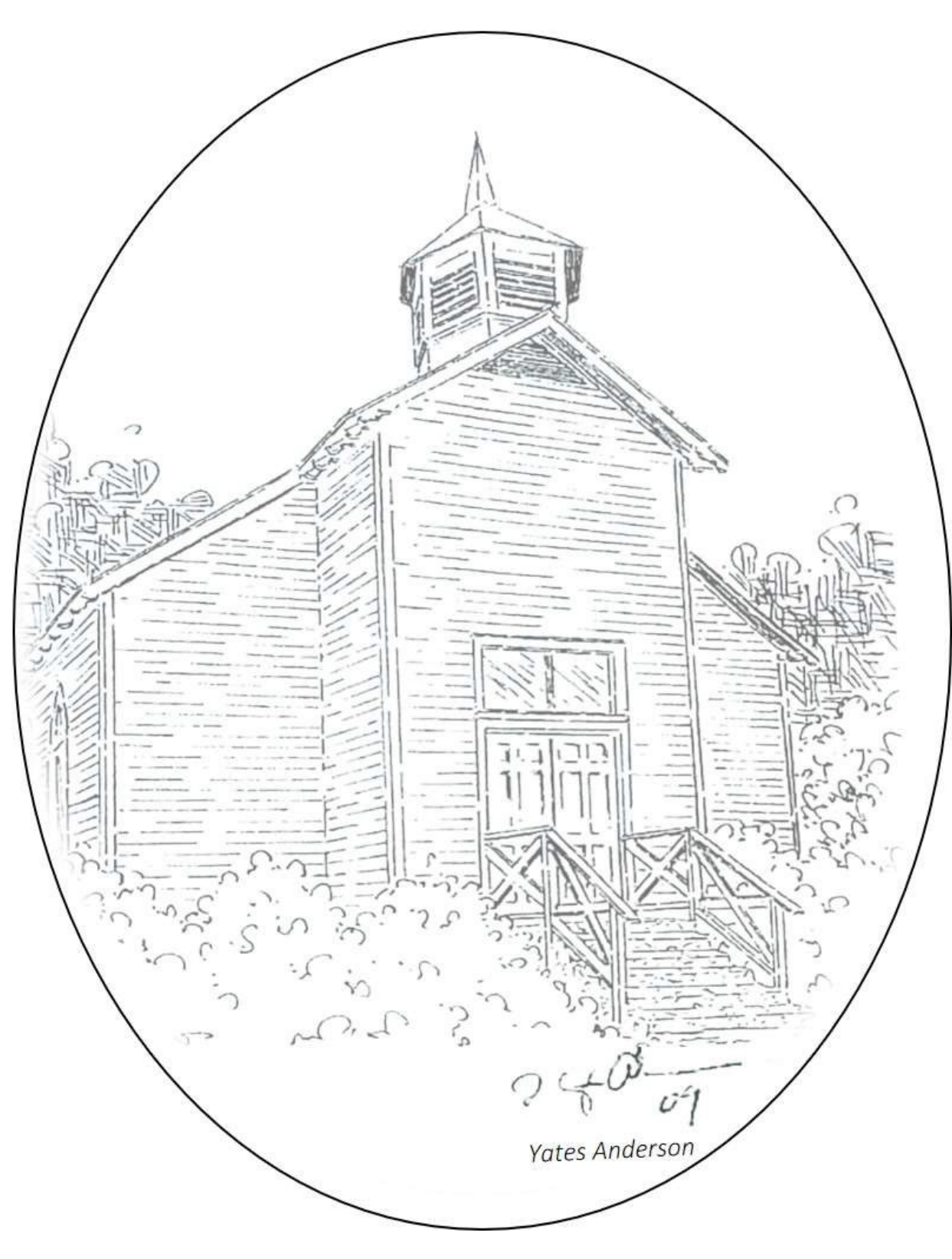
Lake Toxarvary United Methodist Church October 20<sup>th</sup>, 2024